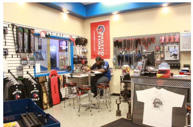
The student will have the option to purchase additional tools at up to 52% off retail from the college.

All tools required for the completion of training are purchased by students during their first quarter of attendance. These tools satisfy the requirements of many employers who request that newly employed technicians supply their own basic tools. For students interested in additional tools, OTC has established a special discount tool-purchasing program for students through the school's on campus MATCO Tool store.