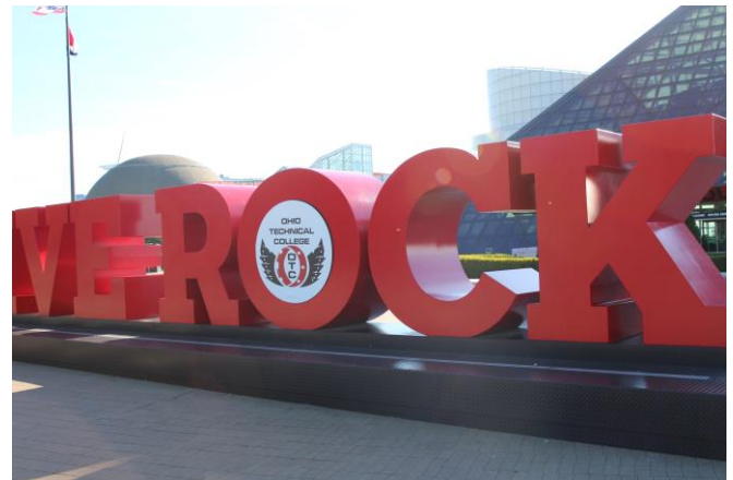
OTC Rocks Cleveland at a sponsored event at the Rock and Roll Hall of Fame