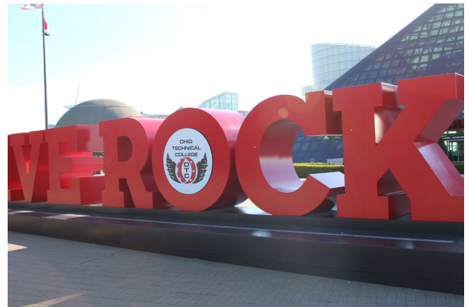
OTC Rocks Cleveland at a sponsored event at the Rock and Roll Hall of Fame