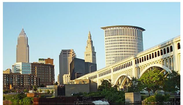
Cleveland is a great place to be!