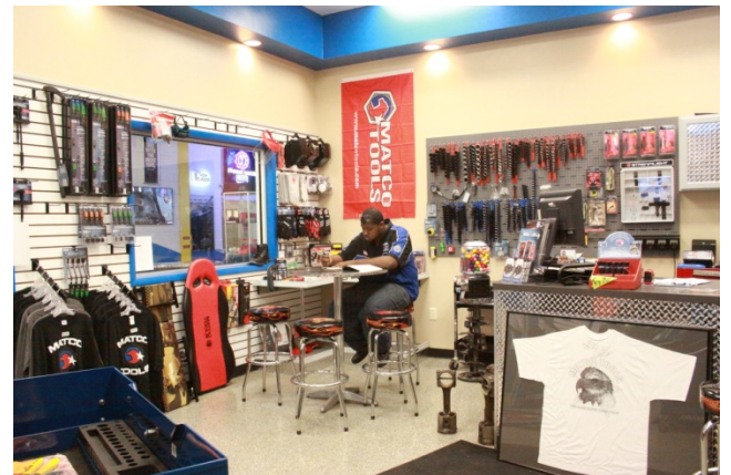
The student will have the option to purchase additional tools at up to 52% off retail from the college.

All tools required for the completion of training are purchased by students during their first quarter of attendance. These tools satisfy the requirements of many employers who request that newly employed technicians supply their own basic tools. For students interested in additional tools, OTC has established a special discount tool-purchasing program for students through the school's on campus MATCO Tool store.