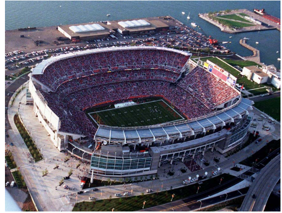
The First Energy Stadium, Home of the Cleveland Browns

Cleveland is located on the coast of Lake Erie. This "Great Lake" offers numerous attractions, aquatic sports, and leisure activities, including power boating, fishing, the Lake Erie Islands, and jet skiing among others. A small city with big city amenities, there is always something to do and places to be seen. At OTC you are 20 minutes away from the country and just minutes from downtown. When you choose OTC you get a quality education in a city that truly lives up to its image.