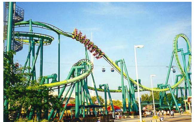
Cedar Point Amusement Park