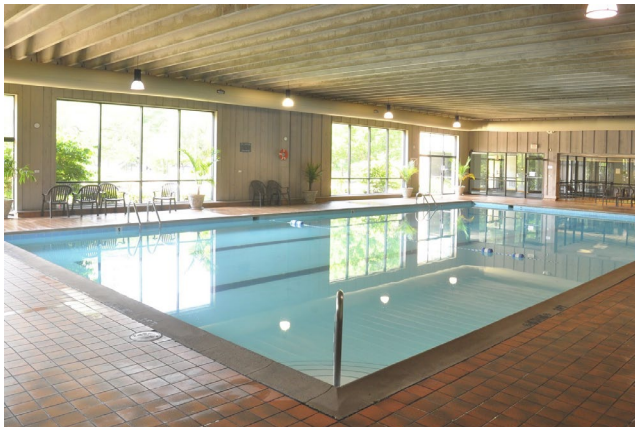
Pools and workout facilities are located in some apartment complexes.

In addition, some apartment complexes offer a pool, workout facilities, optional parking garage and easy access to jobs, shopping and food.