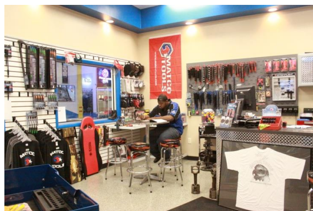
The student will have the option to purchase additional tools at up to 52% off retail from the college.

All tools required for the completion of training are purchased by students during their first quarter of attendance. These tools satisfy the requirements of many employers who request that newly employed technicians supply their own basic tools. For students interested in additional tools, OTC has established a special discount tool-purchasing program for students through the school's on campus MATCO Tool store.